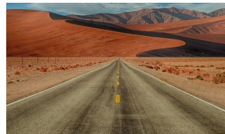
“When a man's ways please the Lord, he maketh even his enemies to be at peace with him.” (Proverbs 16:7)

our personal choices to please Him would regularly abound in our lives. This is what the bible clearly teaches us in 1 Thessalonians 4:1 - “Furthermore then we beseech you, brethren, and exhort you by the Lord Jesus, that as ye have re-